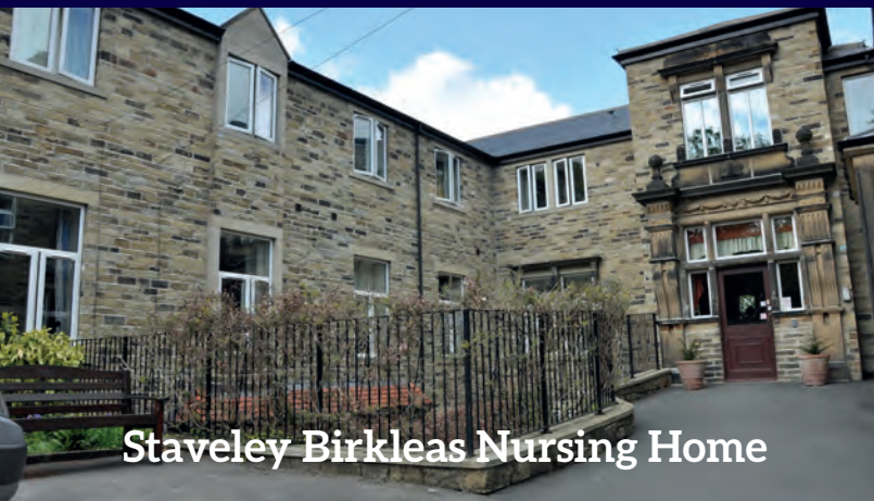
Staveley Birkleas Nursing Home