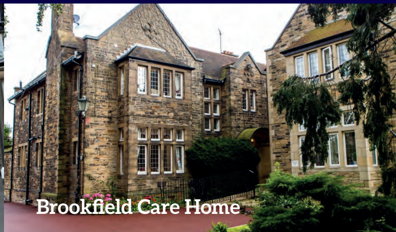
Brookfield Care Home